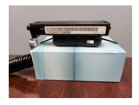
Tag will disarm for removal.

Align the ears of the detacher with the indentations on the tag.