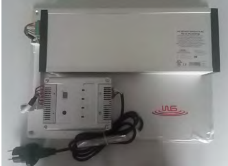
System controller with SPS Smart Power supply on the mounting plate