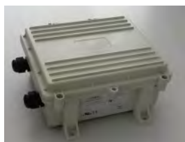
Floor Guard Adapter box