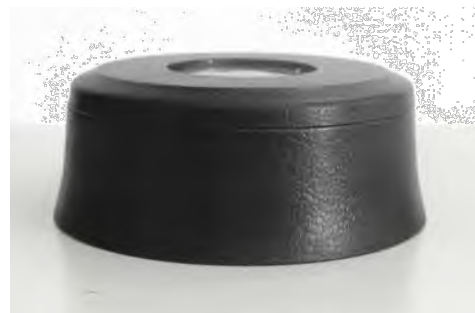
Table top mount with enclosed Slip Ring.