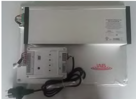
System controller with SPS Smart Power supply on the mounting plate