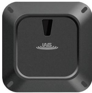
RAD (Radiate and Detect Unit)